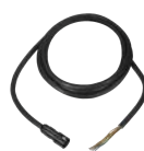
WV-QCA502 I/O Cable for Aero PTZ camera