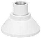
WV-QSR506F1-W Mount Bracket