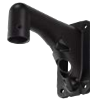
WV-QWL501-B Mount Bracket